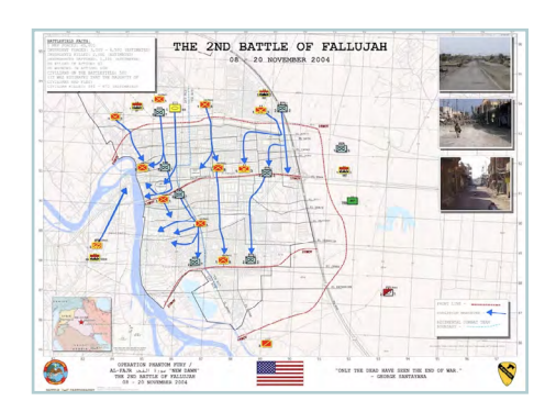
[the battle plans and the aftermath of the second battle of Fallujah.]