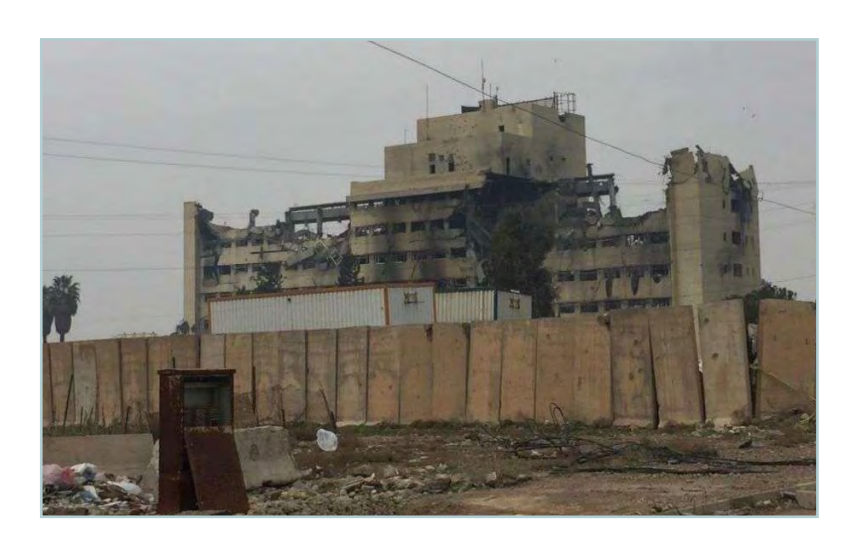
[Sarah Margon/ Human Rights Watch]

"The ISIS terrorists continue to ignore the Law of Armed Conflict and use protected sites such as hospitals, schools and mosques to try and shield themselves from Coalition airstrikes". 49