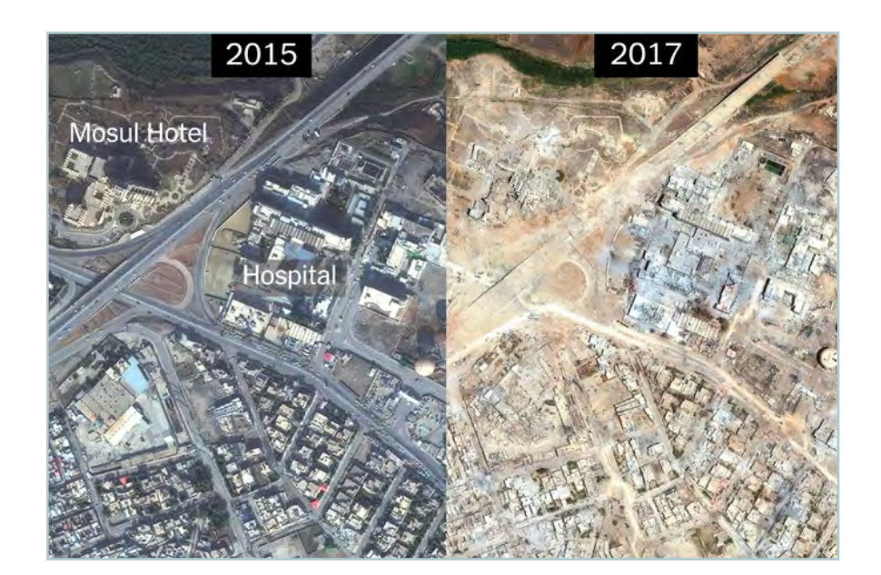
[satellite imagery of Mosul – before and after the battle<sup>14</sup>]

These test cases demonstrate the obvious – war is not a sterile event, and inevitably involves damage, destruction, and death. The law of war is not meant to prevent wars but rather to prevent any suffering that can be avoided without impairment to military necessity.